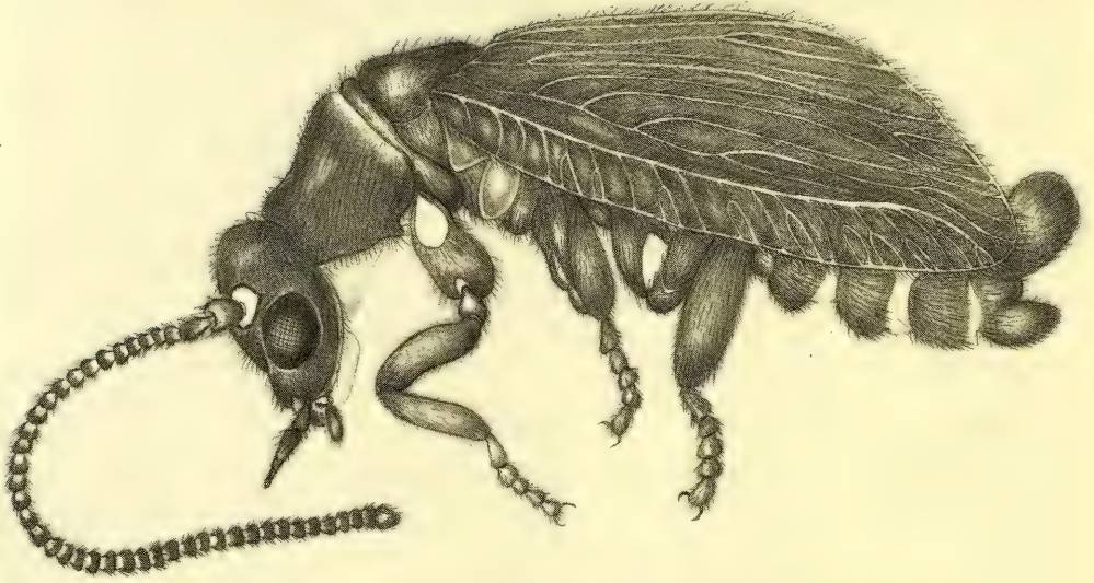
Fig. 1: Lateral view of Nusalala andinus , n. sp. (drawn by Artêmio Coelho da Silva).